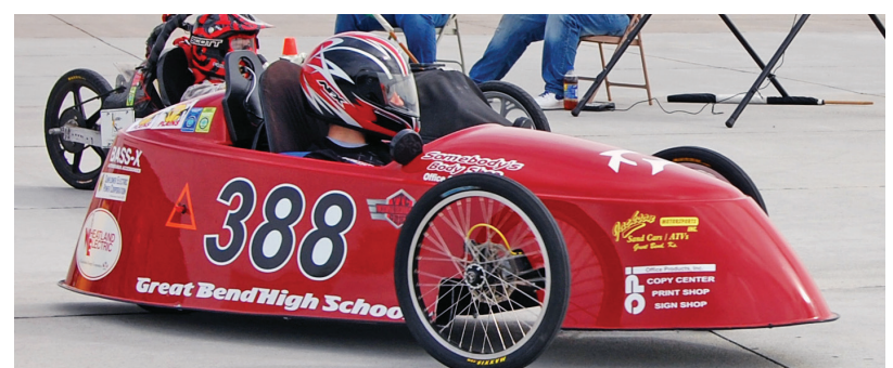
Last year, car #388 was sponsored by Wheatland Electric and represented Great Bend High School.

Wheatland Electric is a proud supporter of the Kansas ElectroRally program. Each year Wheatland helps to sponsor ElectroRally programs from high schools in Scott City and Great Bend.